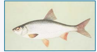
Roach ( Rutilus rutilus )

PIT tagged roach ( Rutilus rutilus ) (n = 100, mean length 13.3 cm) and rudd ( Scardinius erythrophthalmus ) (n = 100, mean length 12.0 cm) were introduced and detections recorded over a period of 7 days, with refuges being moved every 24 h to allow for possible pond effects or effects due to proximity of adjacent refuges.