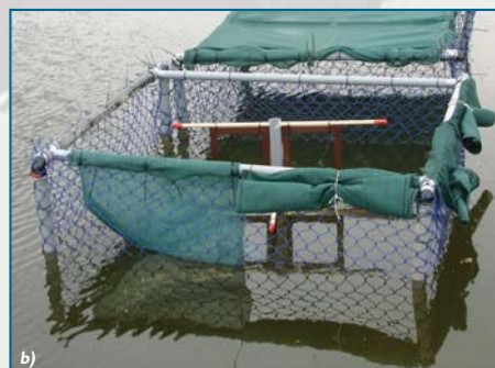
Figure 2: Detector array positioned in a) open water and b) inside a fish refuge within the trial lagoon (note - lagoon only part full and refuge construction finalised after positioning of detector array).

PIT tagged roach ( Rutilus rutilus ) (n = 100, mean length 13.3 cm) and rudd ( Scardinius erythrophthalmus ) (n = 100, mean length 12.0 cm) were introduced and detections recorded over a period of 7 days, with refuges being moved every 24 h to allow for possible pond effects or effects due to proximity of adjacent refuges.