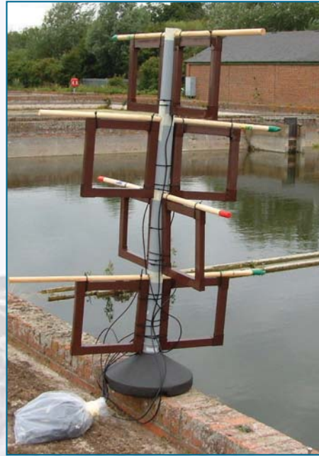
Figure 1: A free-standing detector array comprising eight individual PIT detector antennae; stands were constructed to allow full coverage of the water column within the trial lagoon.