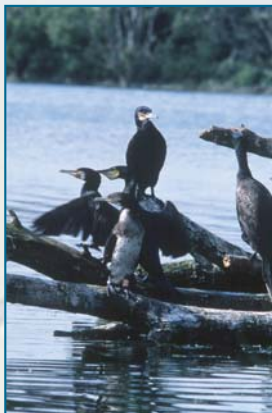
Cormorants loafing at an inland fishery

Each array consisted of eight individual PIT antennae, made of high impact PVC box section and were waterproof (IP68) and fitted with 10m cables. Each antenna was linked to a multi-point PIT decoder (MPD) unit (two were used in these trials), consisting of a 24 V DC integrated MPD/antenna multiplexer (16 channel), powered by two 12 V (120/140 Ah) lead-acid batteries. Each MPD unit was capable of sequentially interrogating up to 16 individual PIT detector antennae every 3.2s and thus supported two arrays. This, in effect, provided continuous remote monitoring of tagged individuals in the immediate vicinity of the detector arrays.