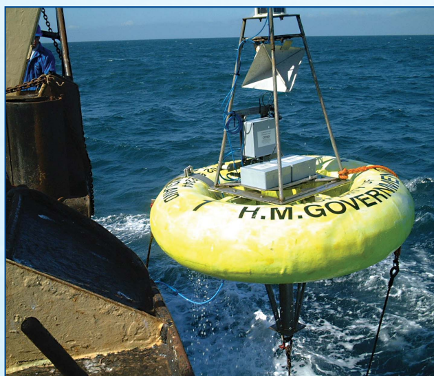
Deployment of the ATB in the North Sea

Field telemetry is ideal for collecting behavioural and biological data of high quality and fine spatio-temporal resolution. However, field telemetry can be an expensive and time-consuming process, particularly when used at sea and especially when data are required from many individuals in more than one location. With this in mind, CEFAS has designed a datalogging Acoustic Telemetry Buoy (ATB) that sends data via a satellite link. Once deployed, this system permits the transmission of near real-time fish behavioural data for long periods at low cost.