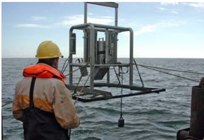
Sediment Profile Imaging (SPI) camera