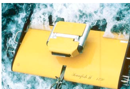
Scanfish tows between the surface and the seabed