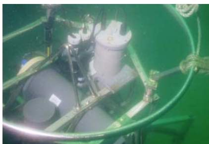
Benthic lander - monitoring the seabed