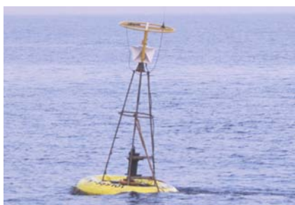
SmartBuoy - monitoring in near-surface waters